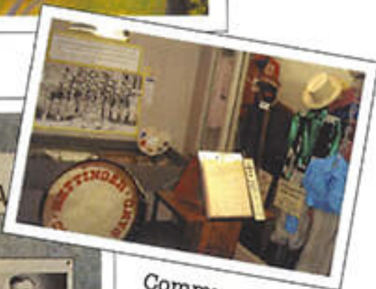
Community band strong after 100 years