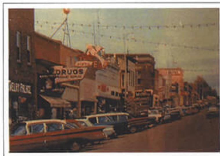
Mid-20th Century Hettinger Main Street

Dakota Buttes Historical Society/Museum works to discover, collect, preserve, display and make available to the public representative items and materials that illustrate the life and time of the area.