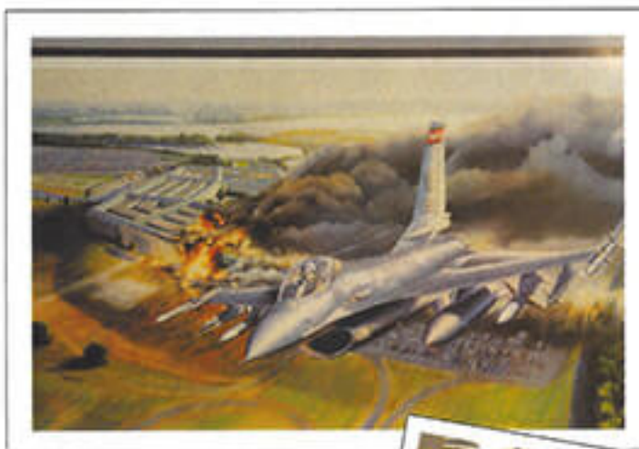
Local pilot protects USA on 9/11