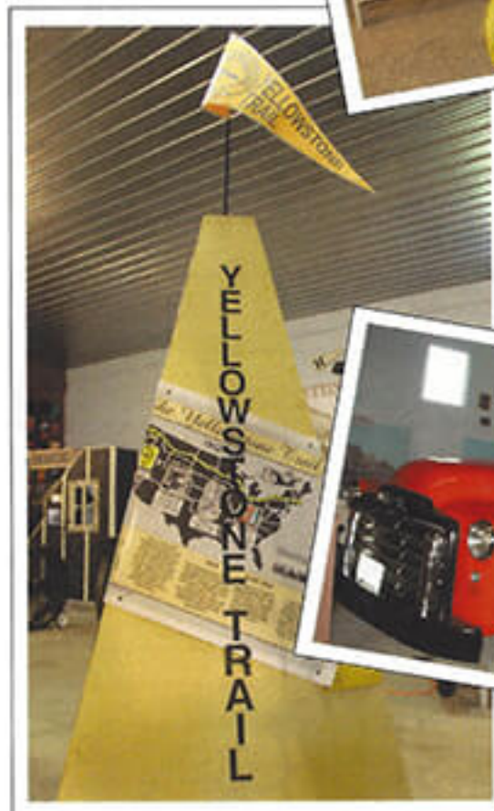
Restored 1949 fire truck

Dakota Buttes Historical Society/Museum works to discover, collect, preserve, display and make available to the public representative items and materials that illustrate the life and time of the area.