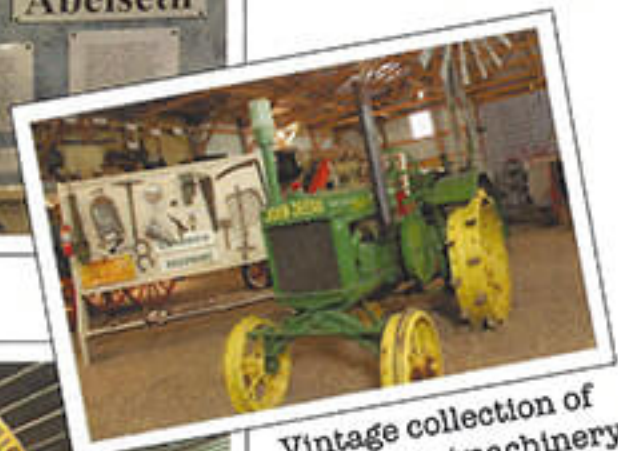
Vintage collection of farm tools/machinery